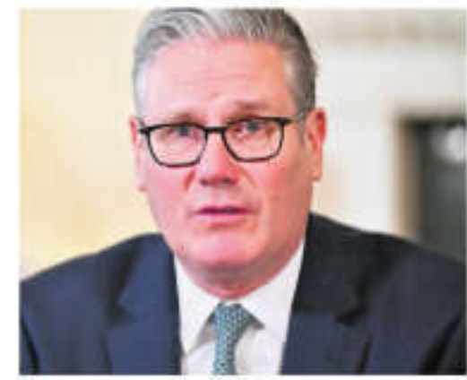
British Prime Minister Keir Starmer

BRITISH Prime Minister Keir Starmer on Friday resisted demands he resign over revelations that his scandal-tainted pick for UK ambassador to Washington was appointed despite failing security checks. Starmer says he was not informed that the Foreign Office had overruled the recommendation of security officials in early 2025 not to give Peter Mandelson the job. Many considered Mandelson a risky appointment because of his past friendship with convicted sex offender Jeffrey Epstein. Starmer said he was "absolutely furious" that he had been kept in the dark, calling it staggering and "unforgivable."