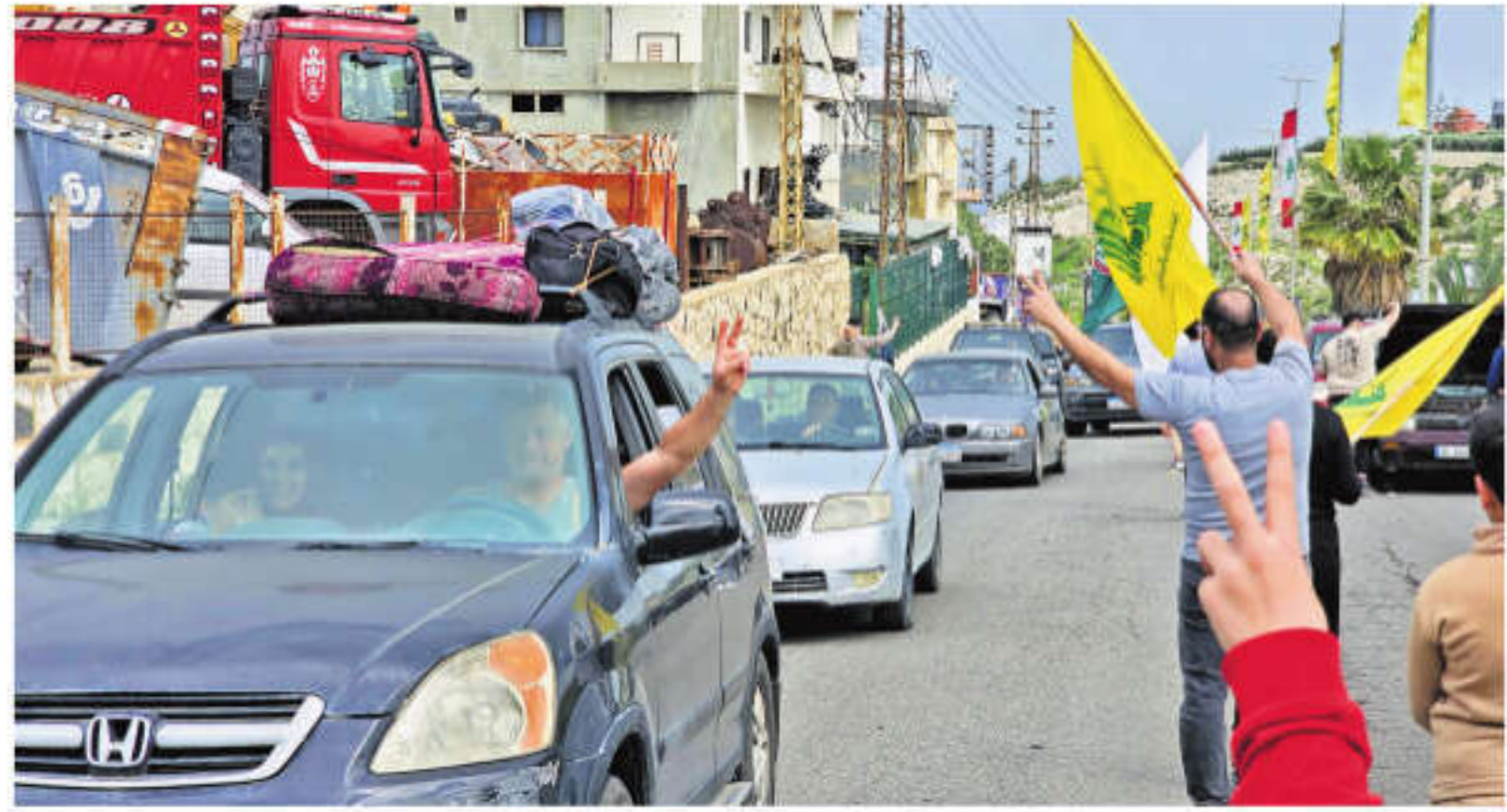
Displaced residents drive back to their homes in the southern Lebanese area of Msaileh

Displaced residents stream back under 10-day truce as army cites violations, with Islamabad continuing efforts to mediate broader deal