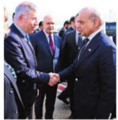
Pakistan's Prime Minister Shehbaz Sharif shaking hands with officials as he departs after attending the 5th edition of the three-day Antalya Diplomacy Forum in Antalya

Munir concludes Iran visit Pakistan's Chief of Defence Forces Field Marshal Syed