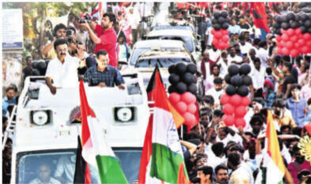
TN CM MK Stalin and AAP leader Arvind Kejriwal campaign in Chennai; Congress leader Rahul Gandhi at a rally in Tirunelveli