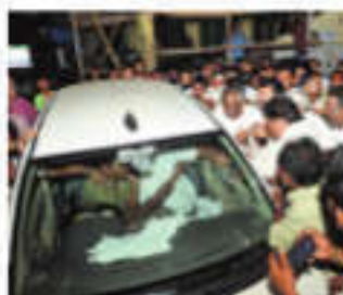
AIADMK cadres damage a car suspecting that it was carrying cash in Ramanathapuram on Sunday

While a scuffle broke out between AIADMK and DMK over alleged cash distribution by DMK supporters in Coimbatore late on Sunday, a purported video of AIADMK candidate instructing cadres on cash distribution in Tenkasi went viral on Monday. In Ramanathapuram, election flying squad officials arrested three AIADMK functionaries on Monday for distributing cash to voters at Sethidal village in Thiruvadanai. ENS