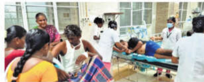
A patient undergoing treatment at the Virudhunagar GMCH