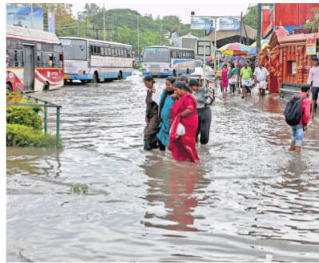
MONSOON IN SIGHT People wading through a waterlogged road at Pazhavangadi in Kerala's Thiruvananthapuram on Saturday after rainfall lashed the region | BP DEEPU

Under the existing practice, estimates were largely prepared with inputs from private agencies, after which tenders were floated, contracts awarded to the lowest bidder and prices negotiated before finalising purchase orders. "With these committees, estimates will undergo multiple levels of scrutiny before tenders are even floated, ensuring rates are realistic, competitive and in line with market conditions," a senior TNPDCCL official said.