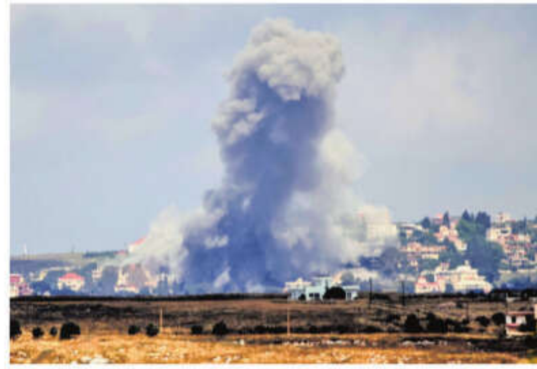
Smoke rising after an Israeli air strike on the village of Maifadoun

The situation in southern Lebanon was discussed during a meeting Saturday between Lebanon's president and prime minister who said in a statement later that they will intensify their contacts to make Israel stop demolition and bulldozing of homes and historical sites as well as its evacuation warnings. Lebanon's state-run National News Agency reported Israeli airstrikes and artillery shelling near the Crusader-built Beaufort castle that is about 15 kilometers (9 miles) from the Israeli border and overlooks wide parts of southern Lebanon. The strategic castle was held by Israeli troops for 18 years until they withdrew from Lebanon in May 2000.