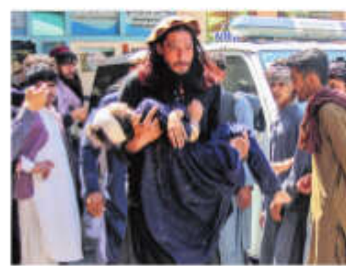
A man carries an injured girl to a hospital in Jalalabad