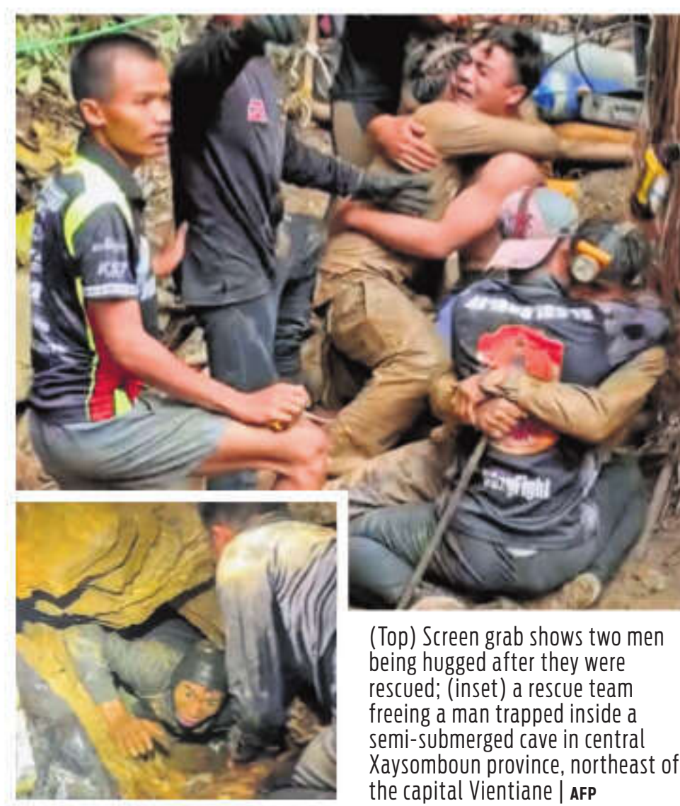
(Top) Screen grab shows two men being hugged after they were rescued; (inset) a rescue team freeing a man trapped inside a semi-submerged cave in central Xaysomboun province, northeast of the capital Vientiane