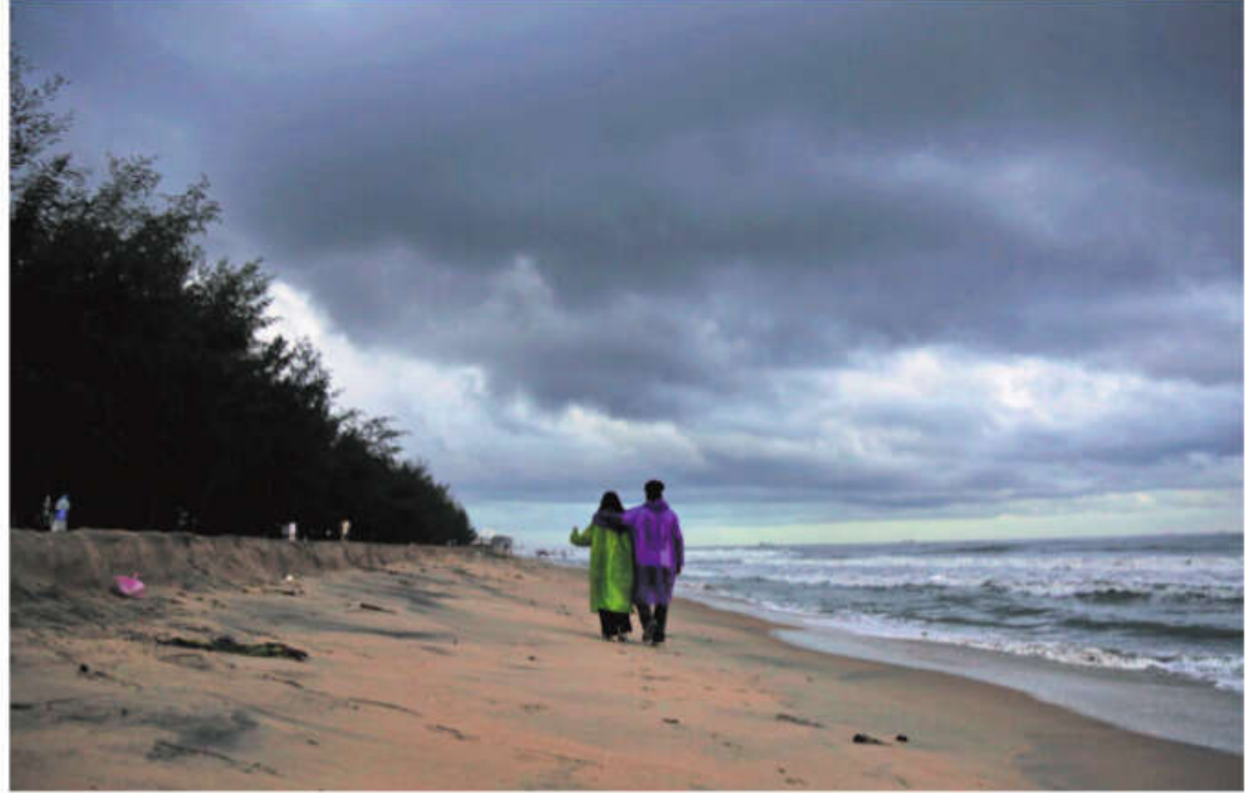
ROMANCING THE RAIN Two youngsters enjoy a breezy evening on Valappu beach as clouds gather overhead on Wednesday

Kochi: Amid the closure of Kuwait airspace, Air India Express flight IX 439 from Kochi to Bahrain, which was scheduled to depart from Kochi airport at 11.45 am, was cancelled on Wednesday. A total of 119 passengers were offloaded and sent back, airport sources said. Kuwait's airspace has been temporarily closed and all flights suspended. The development came following a drone strike on Terminal-1 of Kuwait International Airport amid rising regional geopolitical tensions.