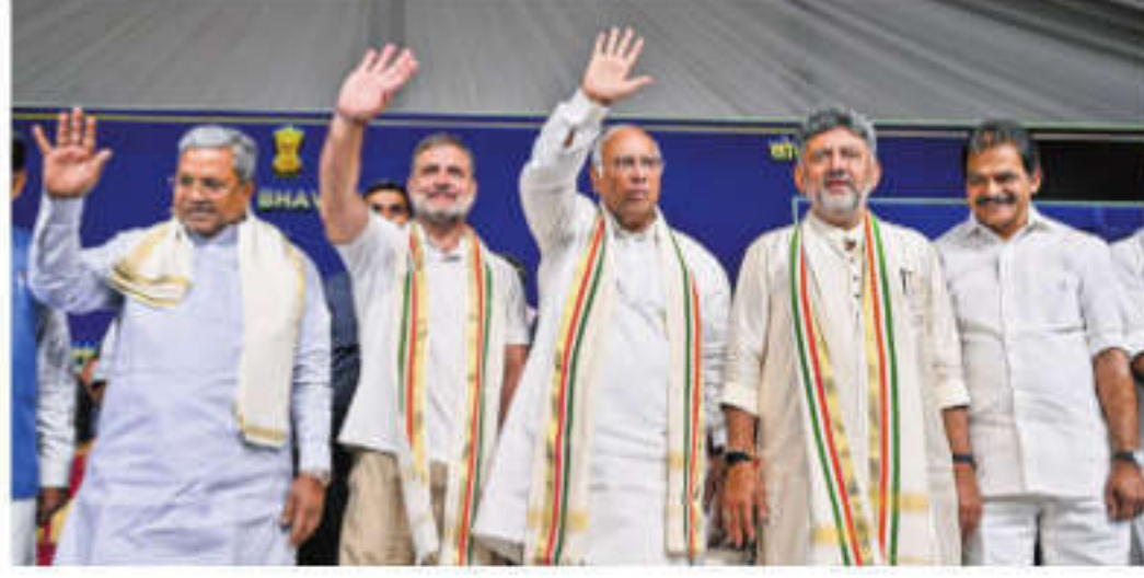
Leader of Opposition in Lok Sabha Rahul Gandhi, Congress President Mallikarjun Kharge, AICC general secretary K C Venugopal, outgoing Karnataka Chief Minister Siddaramaiah and CM D K Shivakumar during the swearing-in ceremony of the new state government in Bengaluru on Wednesday