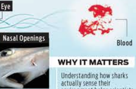
Movies and myths often exaggerate shark behaviour, creating unnecessary fear around these animals