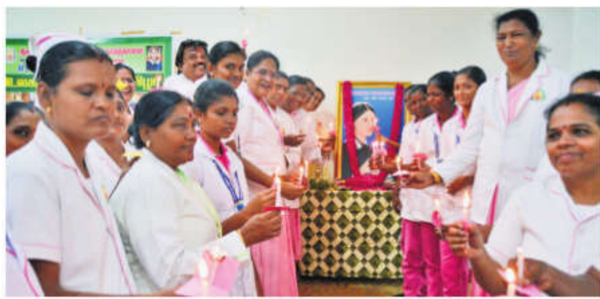
Marking the International Nurses Day (May 12) the nursing staff and students of the Tirunelveli Government Hospital held a candlelight tribute in remembrance of Florence Nightingale, honouring her service and dedication to patient care. Nurses Day is observed on the birth anniversary of Florence Nightingale who is regarded as the founder of modern nursing